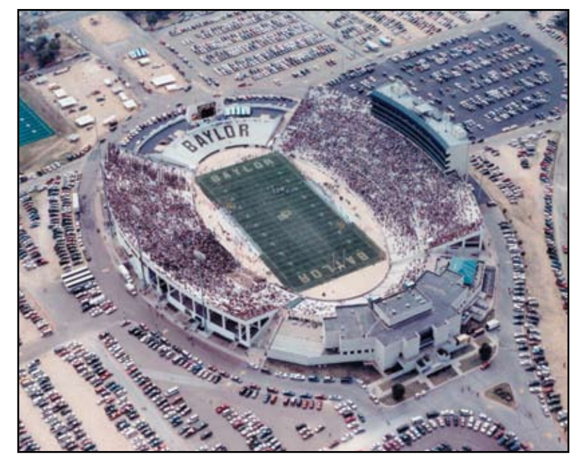
Baylor University Stadium, Waco, Texas, 1950. When opened, the 50,000-seat facility was the showpiece sports facility in the Southwest.

In the early part of the 20<sup>th</sup> century, structural steel fabricators and concrete reinforcement steel suppliers in many parts of the country usually furnished structural design as part of their bid package. Offering structural design for a fee along with architectural services was a new concept in