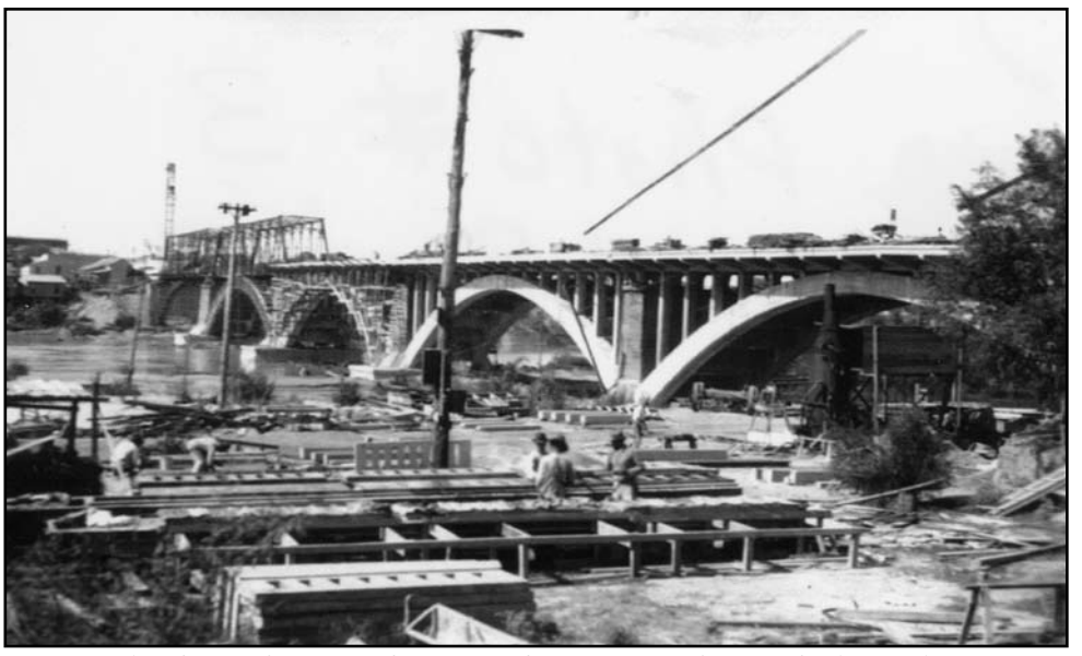
International Bridge over the Rio Grande River, Laredo, Texas, 1921. The 1,600-foot long, multi-span, concrete arch structure was the longest and first-of-its-kind in the area.

In the early 1900s, just before the start of WWI, bigger and more complex building structures were being envisioned nationwide and the call for (and value of) consulting structural engineers like the Simpsons increased dramatically. In Texas, this need was further heightened by the realization that unstable upper soils in areas like San Antonio and the Texas Gulf Region were wrecking havoc on buildings and