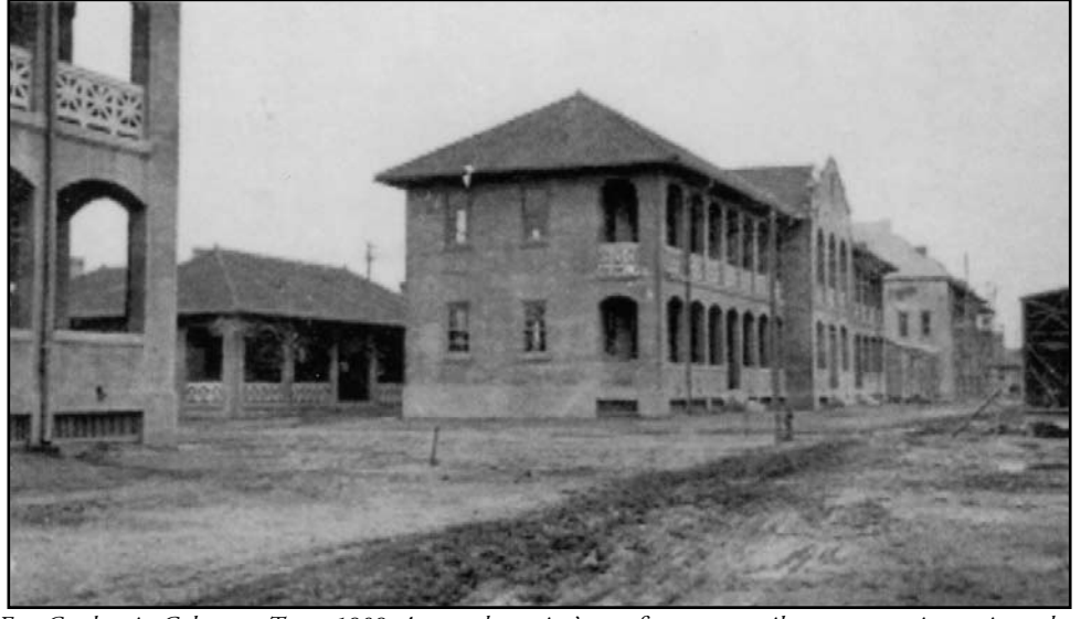
Fort Crockett in Galveston, Texas, 1909. Among the nation's very first concrete tilt-up construction projects, the first completed using design-build construction techniques.