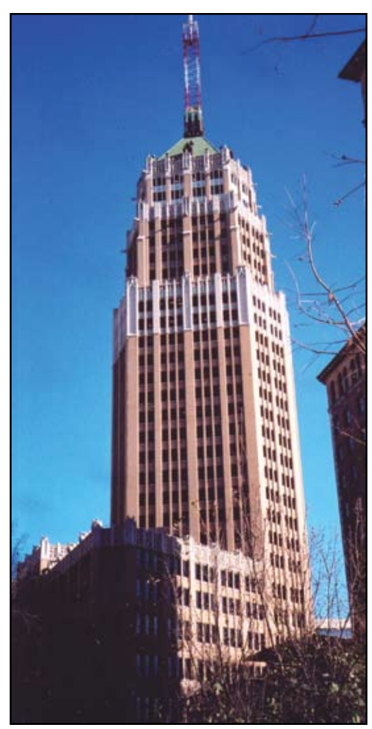
Tower Life (Smith Young) Building, San Antonio, Texas. The tallest building in San Antonio for 60 years, from 1928 until 1988. Listed on the National Register of Historic Places.

cable roof having a tension-ring in center and a compression-ring at the outside. Trapezoidal precast concrete panels, attached between the cables, formed the roof deck.