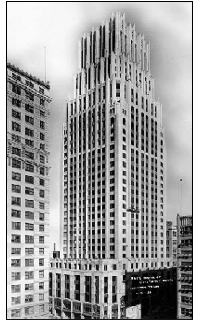
Gulf Building (JR Morgan Chase Building), Houston, Texas, 1929. The symbol of the Houston skyline for years and its tallest skyscraper from inception until 1963. Designated a National Civil Engineering Landmark in 1997.

structures. Conventional foundations in southwestern Texas at the start of the 20<sup>th</sup> century were mostly shallow footings, bearing on just-below-thesurface soils, which expanded and contracted during wet and dry cycles severely damaging buildings.